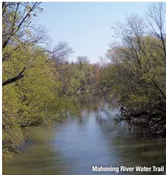
Mahoning River Water Trail

FEATURES: • Nature Observation • Hiking • Walking • Cross Country Skiing • Mountain Biking