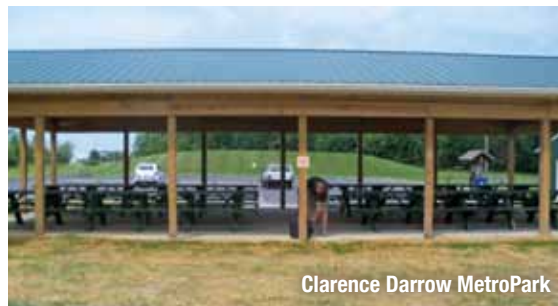
Clarence Darrow MetroPark

FEATURES: • Nature Observation • Hiking • Walking • Cross Country Skiing • Sled Riding