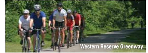
Western Reserve Greenway

FEATURES: • Paddling • Fishing • Nature Observation