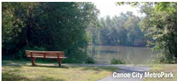
Canoe City MetroPark

FEATURES: • Canoeing/Kayaking • Walking • Fishing • Nature Observation • Picnic Facilities